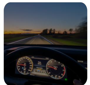
Poor night vision